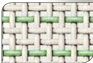
PRIMOBOND.HD with 2 shaft paper side

PRIMOBOND.HD adapts the unique PRIMOBOND 24/6-shaft Benefits Specifically for Packaging Grades