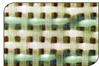
MD frame length < 0.22 mm