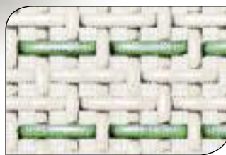
PRIMOBOND.HD with 3 shaft paper side